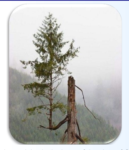
"And we rejoice in the hope of the glory of God. Not only so, but we also rejoice in our sufferings, because we know that suffering produces perseverance; perseverance, character; and character, hope. And hope does not disappoint us, because God has poured out his Love into our hearts by the Holy Spirit, whom he has given us." Romans 5:3-5

"SUFFERING PRODUCES PERSEVERANCE; PERSEVERANCE, CHARACTER; AND CHARACTER, HOPE" Romans 5:3