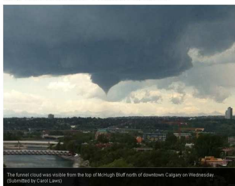
The funnel cloud was visible from the top of McHugh Bluff north of downtown Calgary on Wednesday.

Funnel clouds spotted, hail as big as golf balls reported in city CBC News Posted: Jul 22, 2015 12:00 PM MT | Last Updated: Jul 22, 2015 7:59 PM MT