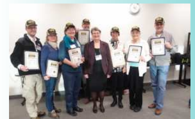
CERT CANada Summit 3 Graduates