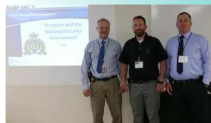
CERT & Terrorism Integrated National Security Enforcement Team, R.C.M.P.