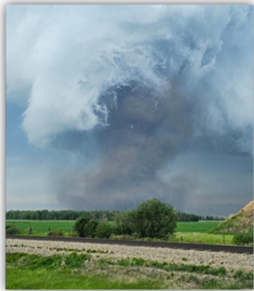
TORNADO, JULY 1, 2023 MOUNTAIN VIEW COUNTY